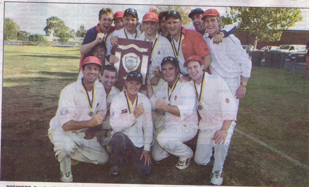
PREMIERS: Bendigo United celebrates its BDCA grand final win.